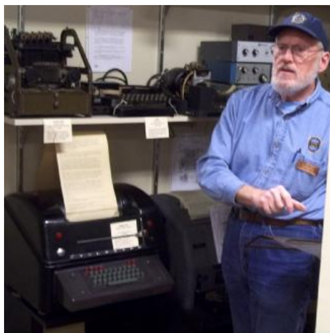
The teletype room.