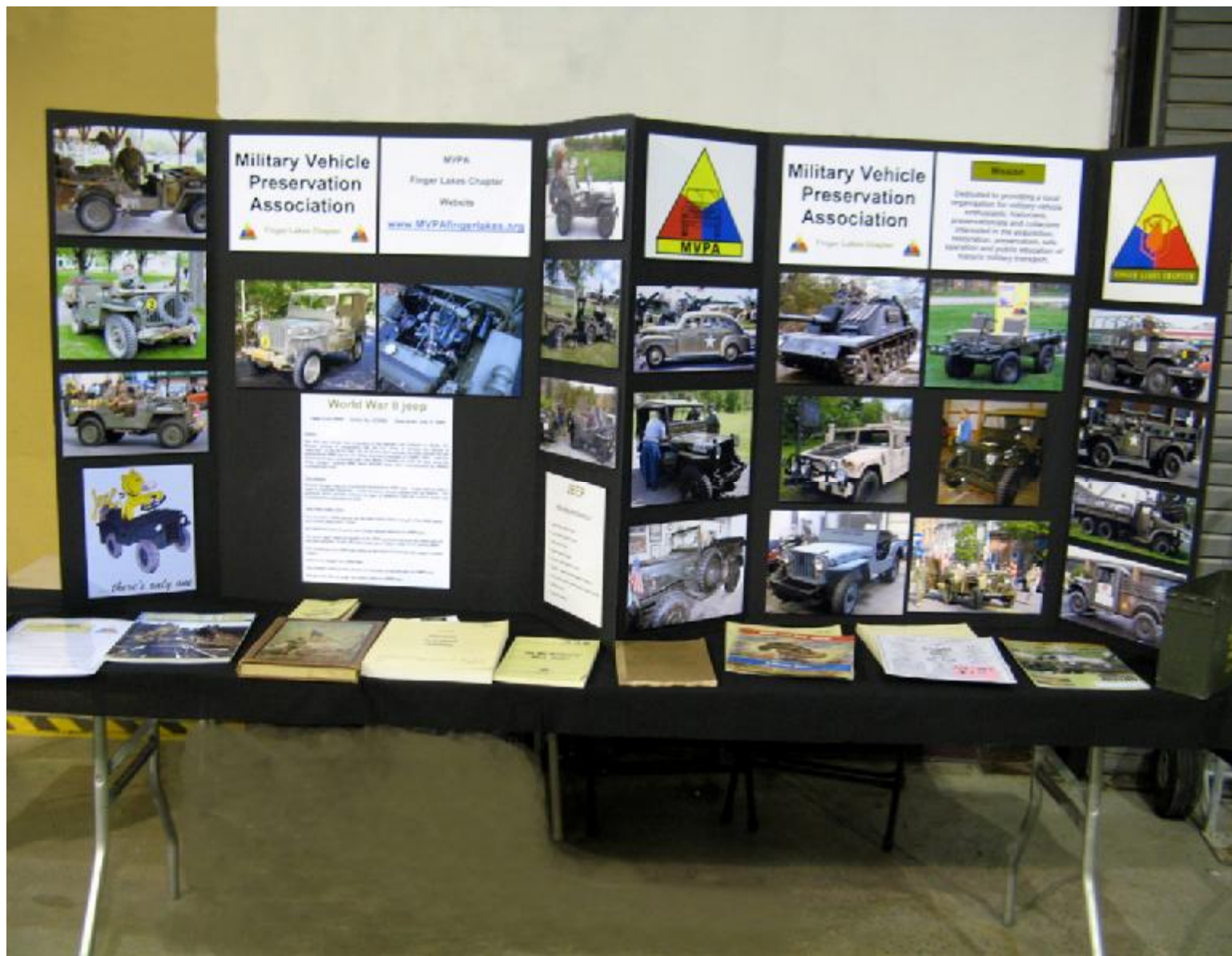
The MVPA – FLC display at the E. S. A. C. A. Original Rochester Gun Show January 10 – 11, 2015.