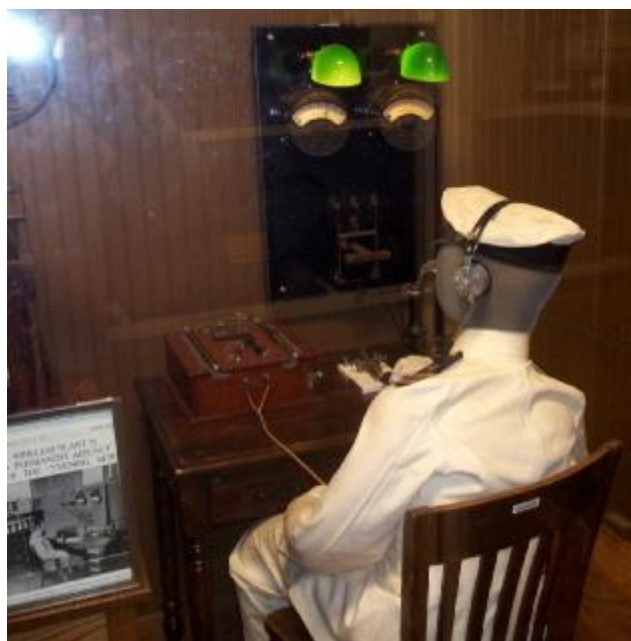
The wireless room on the Titanic.

Antique Wireless Museum Tour November 8, 2014 Bloomfield, NY